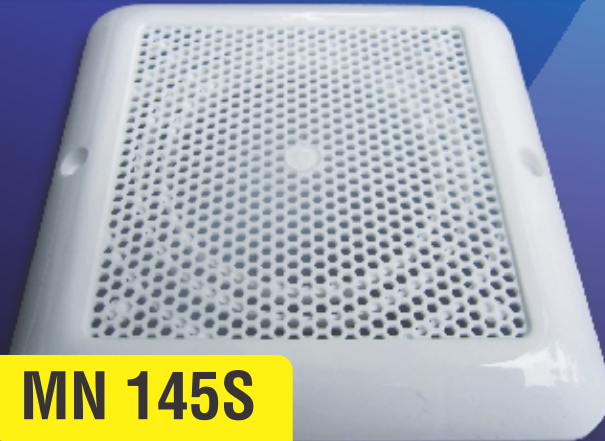
MN 145S Size: 145 x 145 x 10 mm