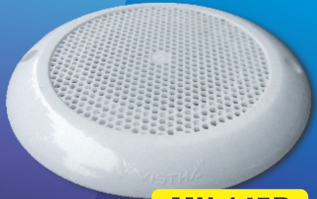
MN 145R Size: 145 x 145 x 10 mm