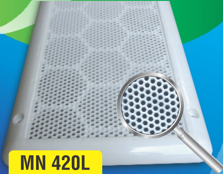
MN 420L Size: 420 x 145 x 10 mm