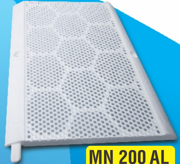
MN 200 AL Size: 200 x 145 x 10 mm